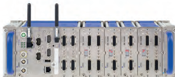
Distributed DAQ System >1000 channels