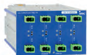
Highly isolated Fiberoptic Measurement System